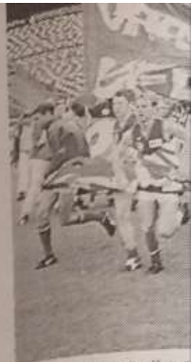
Running onto the stumps Power players break

The up and coming season is nearly upon as let's hope it's a successful one for Drouin.